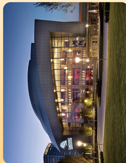
OCTOBER 13, 2017 COBB ENERGY PERFORMING ARTS CENTRE

Georgia Chapter American Academy of Pediatrics Georgia Pediatric Nurses Association Georgia Pediatric Practice Managers Assoc. 1330 West Peachtree Street, NW, Suite 500 Atlanta, GA 30309-2904